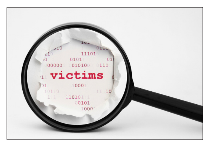
ICJIA's newly established Center for Victim Studies designs and conducts research examining the nature and scope of victimization in Illinois.

Researchers conducted a study analyzing five-year trends among sexual violence victims served by state funded rape crisis centers in Illinois. During the period analyzed, rape crisis centers provided services to more than 10,000 victims each year on average, of which 40 percent were children. Study findings were