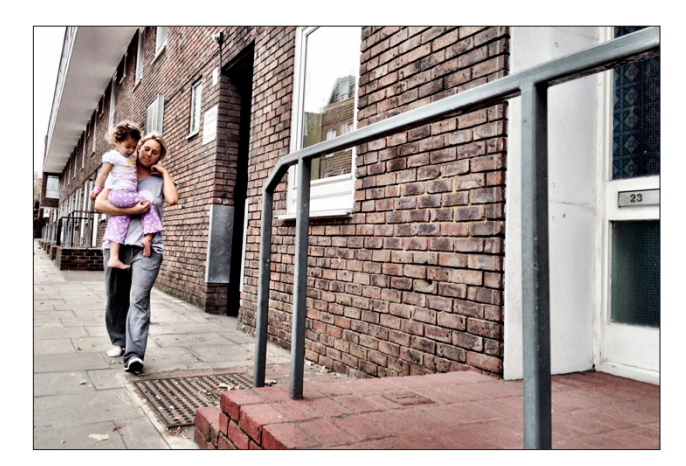
"Transitional Housing for Victims of Intimate Partner Violence," describes the relationship between housing instability and victim health and well-being. Read more at www.icjia.state.il.us.

The Research Report, "Male Survivors of Urban Violence and Trauma: A Qualitative Analysis of Jail Detainees," was published in December 2015.