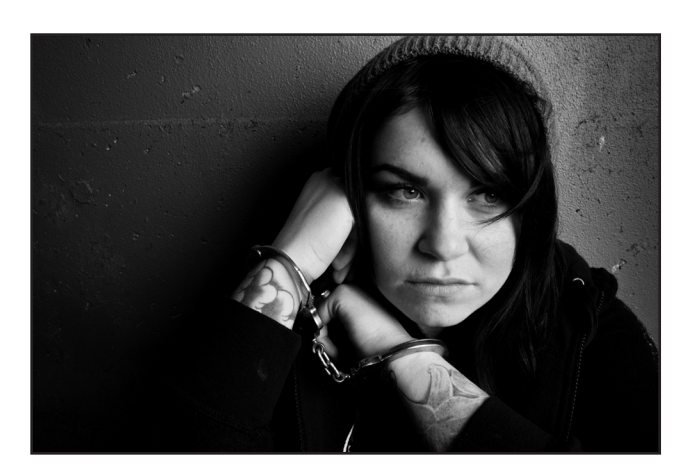
Read "The Use of Incarceration to Address Juvenile Delinquency: Court Evaluation Admissions to the Illinois Department of Juvenile Justice" online at www.icjia.state.il.us.

Court evaluations, new commitments, and technical violations are three ways in which youth may be admitted to the Illinois Department of Juvenile Justice (IDJJ), the state's juvenile corrections agency. Published in March 2016, Research Article, "The use of incarceration to address juvenile delinquency: Court evaluation admissions to the Illinois Department of Juvenile Justice," examined admissions to IDJJ for court evaluations, focusing changes in admission