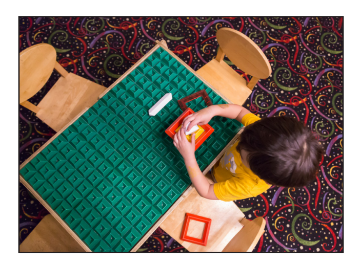
"Addressing Childhood Exposure to Violence" provides an overview of the Illinois Safe from the Start program, program outcomes, and implications for policy and practice. Read more at ww.icjia.state.il.us.

The Community Violence Prevention Program had three components—the Youth Employment Program (YEP), Parent Program, and Re-entry Program. The Reentry Program served formerly incarcerated youth and young adults returning to 21 Chicago-area communities by providing or linking them to services. Center staff designed and implemented a database for capturing Re-entry Program client information and services submitted from 49 case managers at 26 program sites as part of the evaluation study. This information was used to document client characteristics, service needs, and outcomes in the final evaluation report, "Re-entry support: Lessons learned from community-based programs," published last fall.